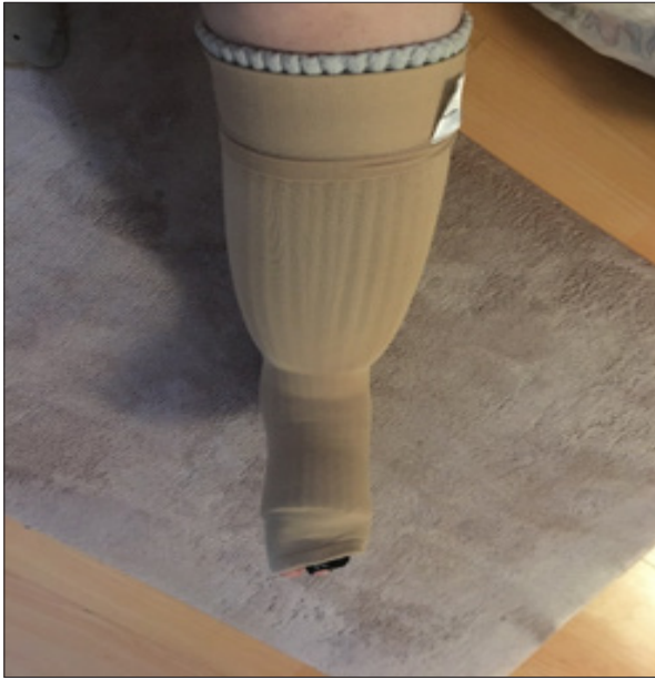
Figure 7. Miss H wearing Comfiwave over the Fusion liner at night

much more confident in her physical appearance and back to wearing straight leg jeans and ankle boots (Figure 6).