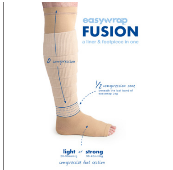
Figure 3. easywrap Fusion liner

To further aid self-management, Haddenham's new Fusion liner is now available on drug tariff (Figure 3). This is an alternative for patients to wear beneath easywrap. Fusion applies compression to the foot and ankle, but no compression above the ankle, making it easy for patients