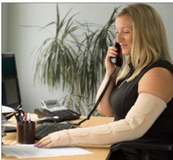
Figure 2. easywrap ARM compression wrap

compression should be started as soon as the patient with cellulitis is stabilised with antibiotics. easywrap can play an important part in recovery from acute cellulitis; where skin is tender and tissues may be soft, it can be applied safely and at a comfortable level for the patient. It can then be easily altered as the cellulitis settles and firmer compression is tolerated, negating the need to buy and fit a number of different garments as the size of the limb changes.