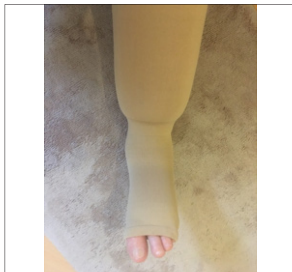
Figure 4. easywrap Fusion liner in situ on Miss H's left leg

Miss H is fully independent and has the tools to self-manage using any combination of garments: Goldpunkt, easywrap, Fusion and Comfiwave. The limbs have both maintained well overall; the volume of the left leg has reduced by 2702 ml since September 2018. Miss H is now