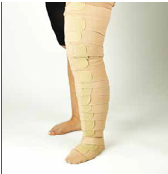
Figure 1. easywrap LEG compression wrap

It is well-recognised that compression is also integral in the management of cellulitis, with Schingale (2019) suggesting that because of its anti-inflammatory properties,